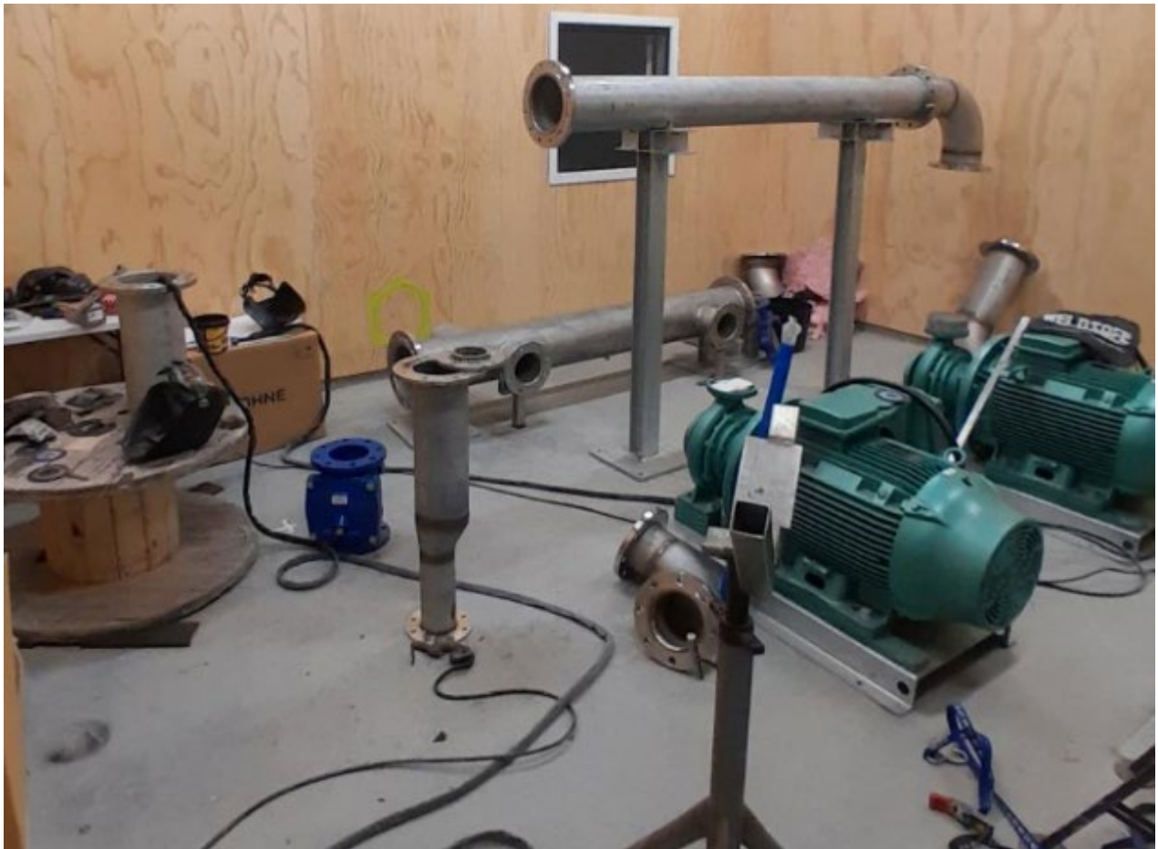
Photo 5 – Cairn Road Pump Station – Progress on Pipework (beginning of Oct)