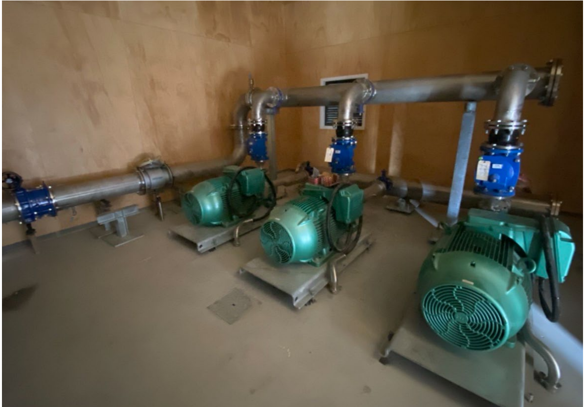
Photo 4 – Upper Greenfield Pump Station – progress on the pipework