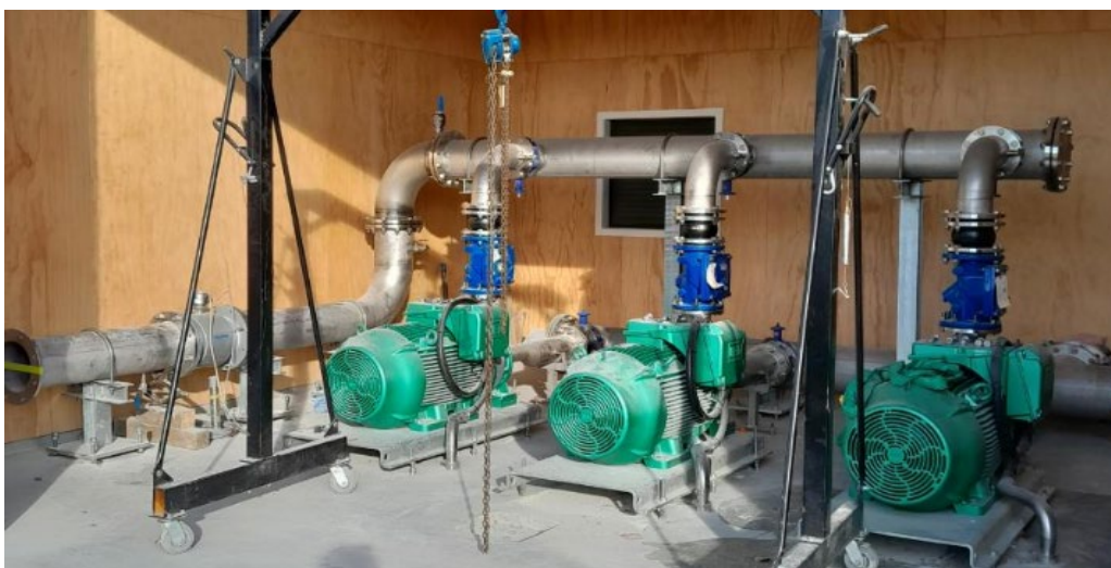
Photo 3 – Lower Greenfield Pump Station – pumps and pipework installed.