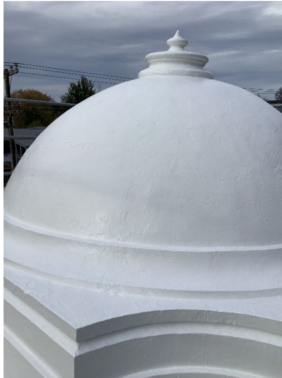
Recently painted roof of the Lawrence war memorial.

The works have been going well even with the weather conditions, the masons have finished renovating the dome and it looks great, however there is the strip in between the lip of the roof and the top of the pillars that looks very out of place with the new paint of the roof and the older but still relatively recent paint of the pillars. The masons are going to continue down to the top of the pillars to make the most of the scaffolding being on site.