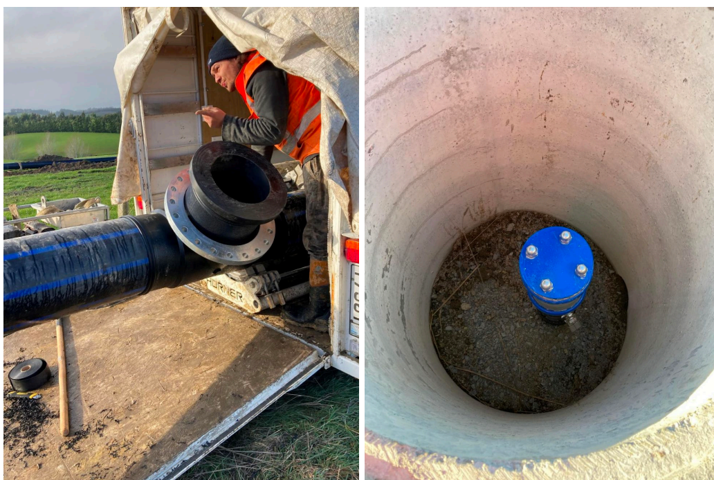
PE pipe Tee being welded and newly installed air valve in concrete chamber.